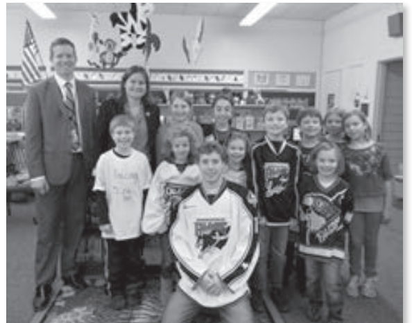
Students and administration of the Tatham School, West Springfield, MA, with members of the American Hockey League's Springfield Falcons, the school's LTL sponsor.