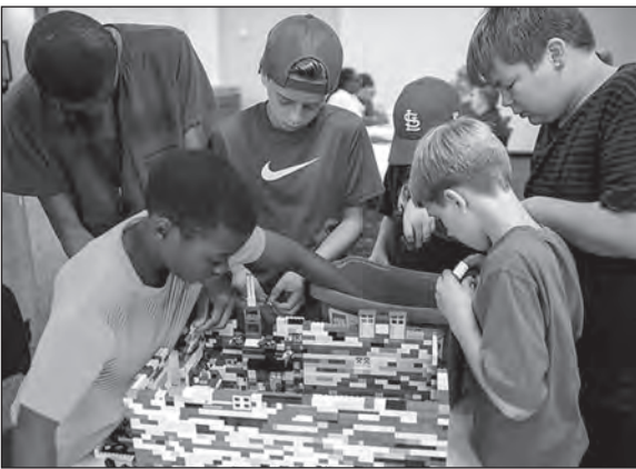
Children play with LEGOs at the Florissant Valley Branch

Libraries in the Ferguson, MO, area provided educational services and creative programs for children and families—and sanctuary for all ages—while the start of school was postponed for two weeks because of