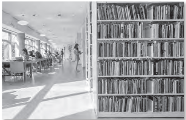
The Reed Foundation Library and Margo Viscusi Reading Room at Poets House

CHP is looking for more writers and libraries throughout the United States to collaborate with for future residencies.